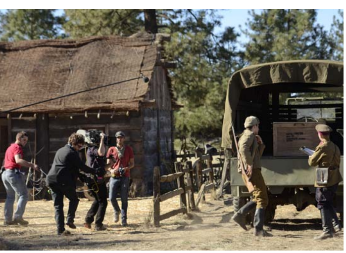
Soilders unload the crate