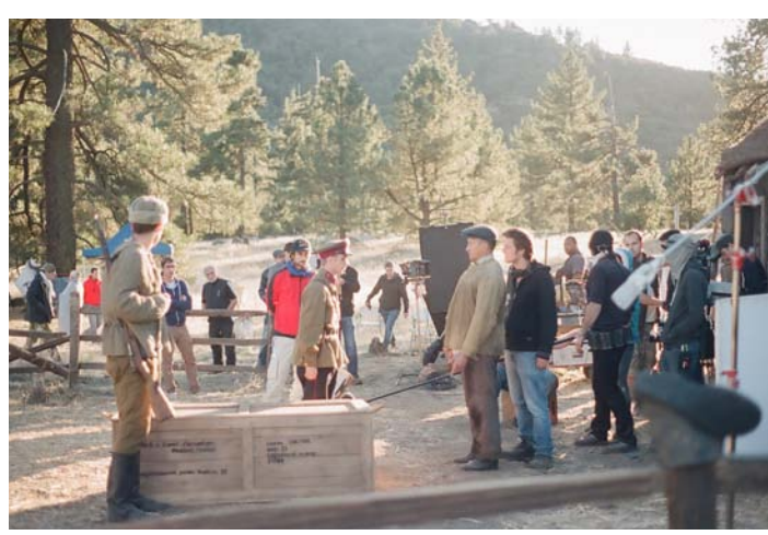
Way in Rye Ext. House Set