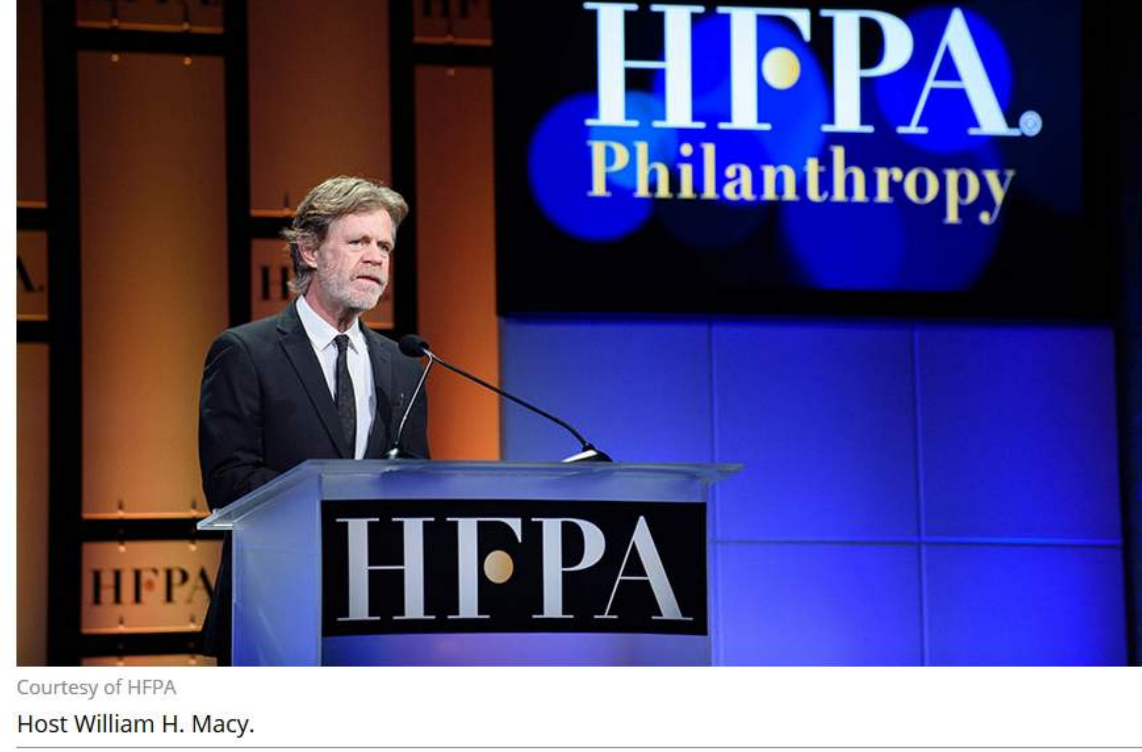
Host William H. Macy.

"We've got this joint to ourselves tonight," explained the actor in his opening remarks as the 2018 host of the HFPA Grants Banquet. "We own it, so spread out." The Shameless star was speaking about the seating — he encouraged guests to enjoy their time in the "pit" because once the Globes come back to the room, A-listers will own the VIP area closest to the stage — but he might as well have been referencing the money HFPA doled out during the gala. It was spread out, too, and there was a lot of it.