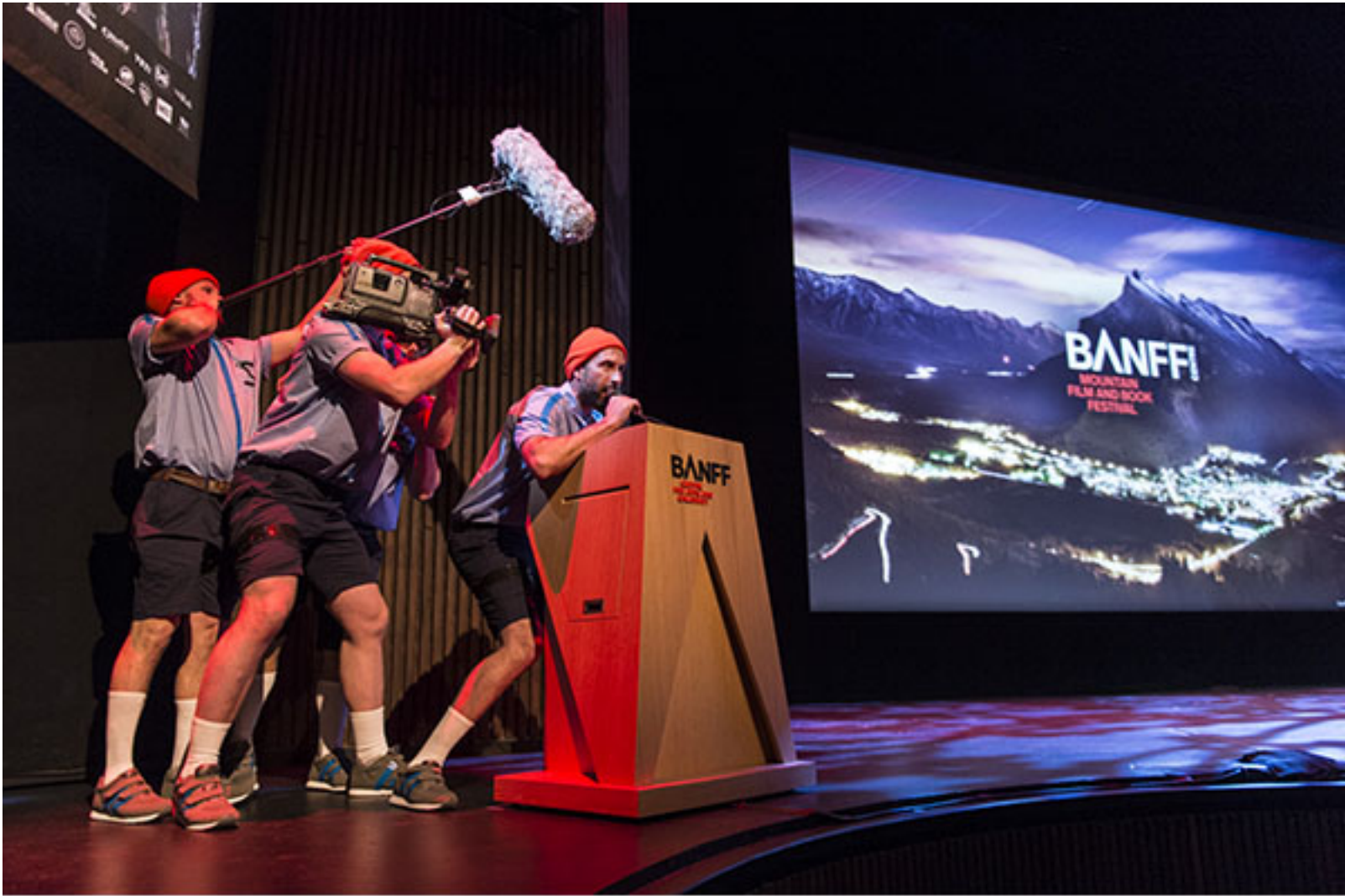
Radical Reels, Banff Centre, Mountain Festival, 2017