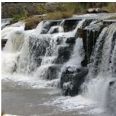
Canada's Top 50 Small Towns