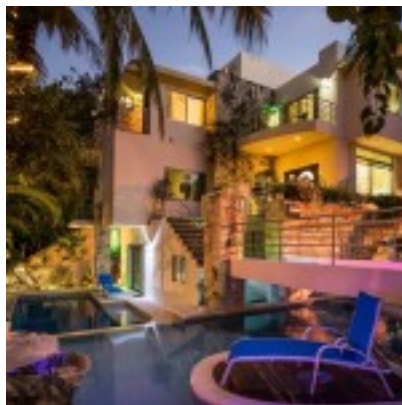
Vacation like a Rock Star!