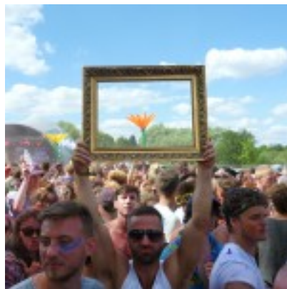
4 Must-See Music Festivals (That Aren't Coachella)