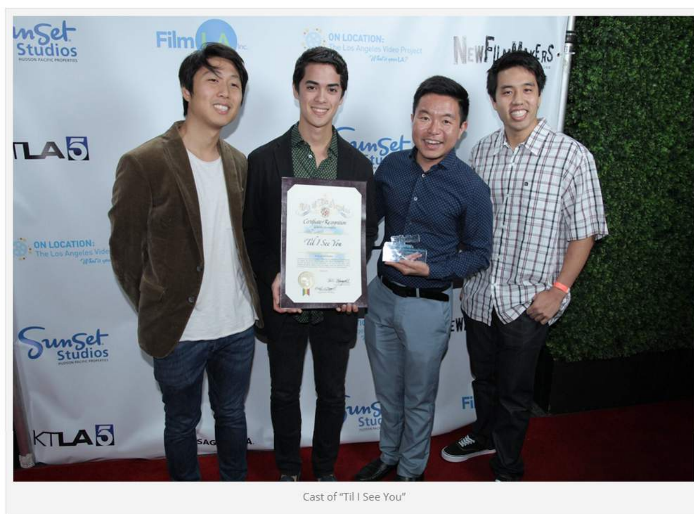
Cast of "Til I See You"

The event launched its screenings to a cheering crowd, stocked up on great company and cocktails, with 300 pairs of hands applauding in unison as the first film made its debut, heralding a night of uplifting messages of love and diversity in family, friendships, and life.