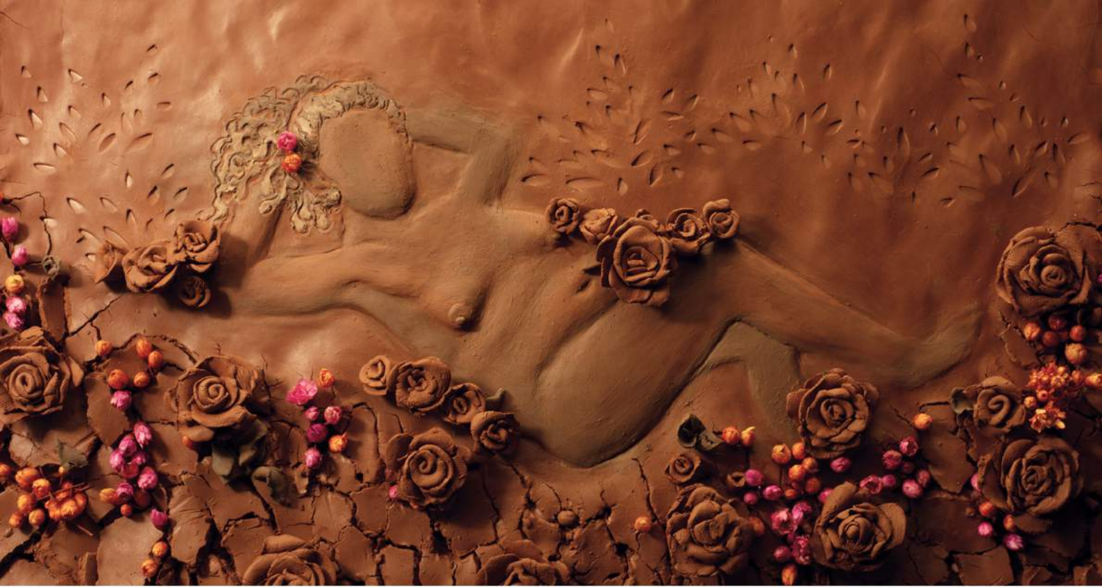
"Medium well" by Cassandra Reis (claymation)