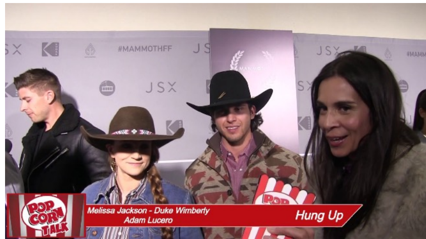
Popcorn Talk Interviews at the 2020 Mammoth Film Festival

Instagram @hungupmovie < https://www.instagram.com/hungupmovie/ >