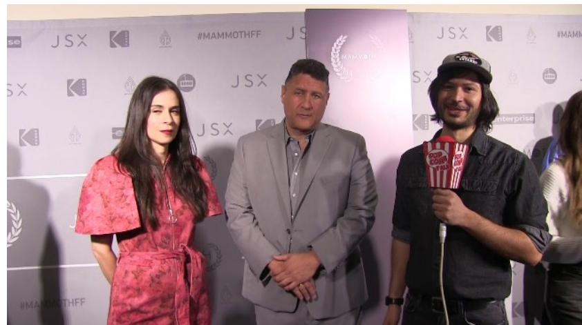
(Click images to watch on YouTube)