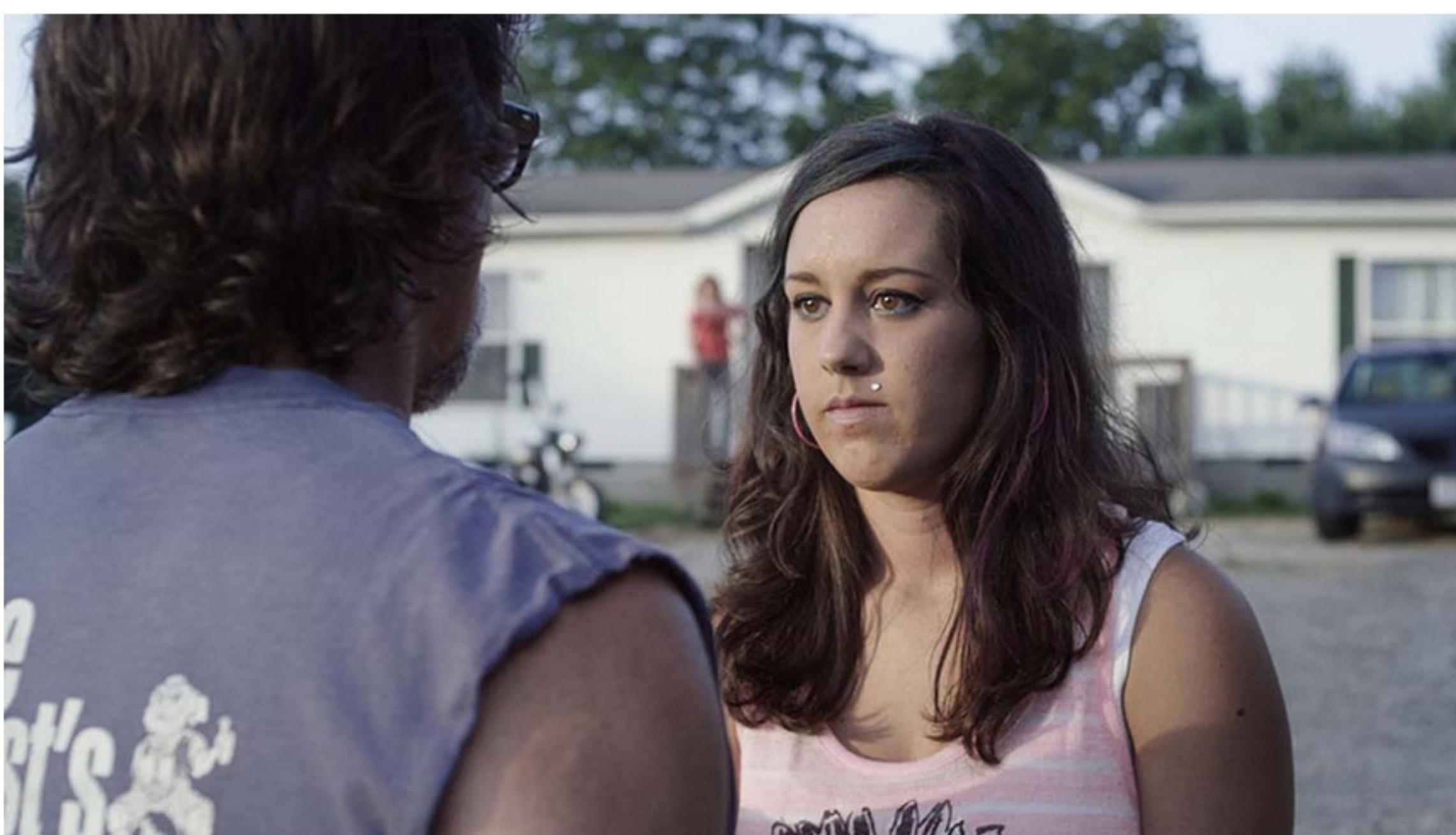
A still from the feature film 'The Turn Out.'

The nonprofit organization dedicated to emerging filmmakers announced nominees and winners for its latest awards event, representing highlights from NFMLA's most recent season's programming.