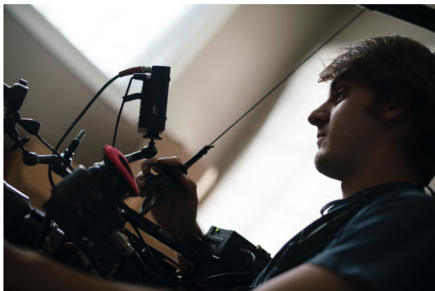
cinematographer Guido Raimondo