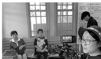
Location. Kiryu's powerful ladies