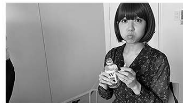
First meeting. Tea break