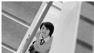
Photo shoot for trailer