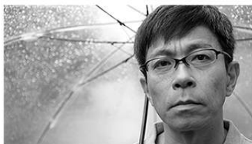
Photo shoot for trailer