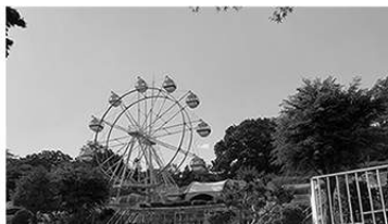
Location. Kiryu Hilltop Park