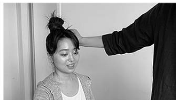
First meeting. Hair makeup meeting