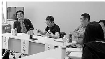
First meeting. Read through the script