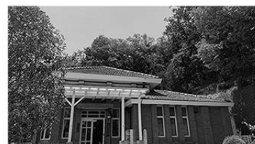
Location. Kiryu retro building