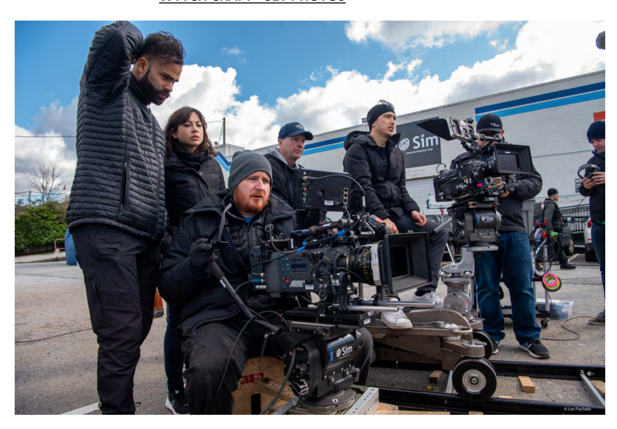
The camera crew lining up a shot on "Wytch Craft"