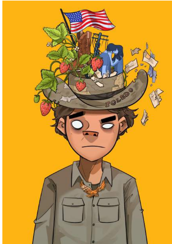
Writer/Director/Editor-Friends Call Us Unlucky (2022) Writer/Director/Editor- Toledo (2023)