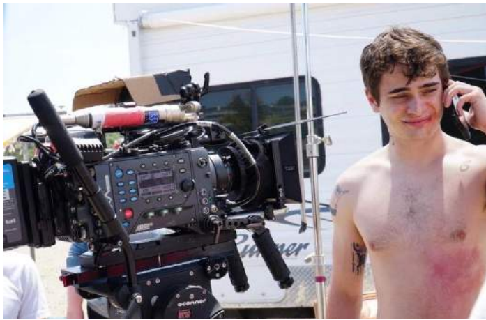
Drew Starkey - Virgo Proof of Concept