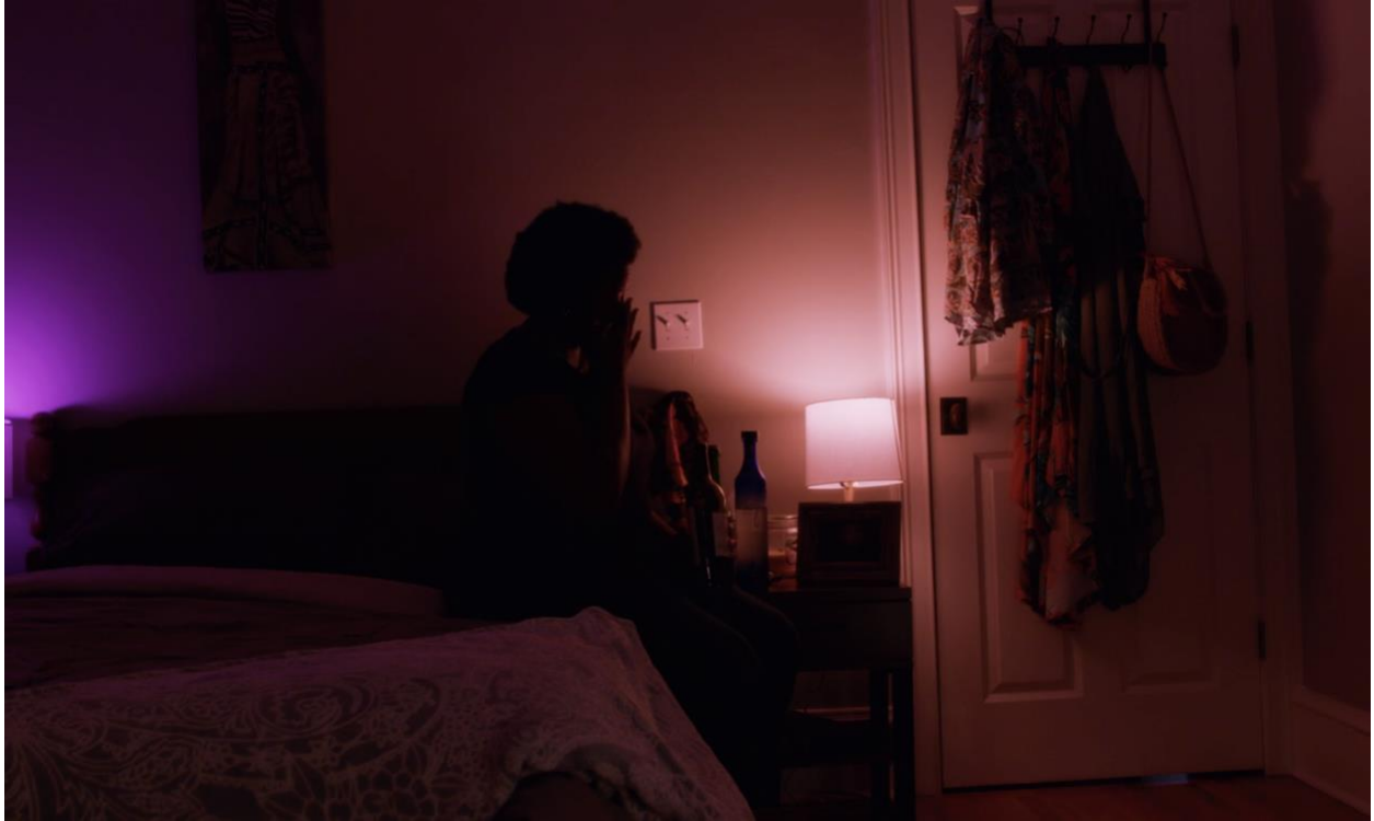
Nicholas' widowed mother.