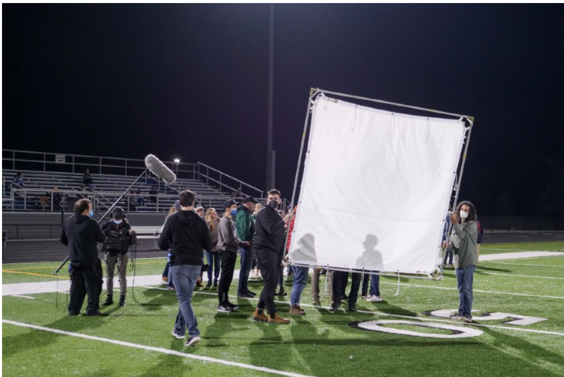
The “Lunchbox” crew preps the football stadium scene.