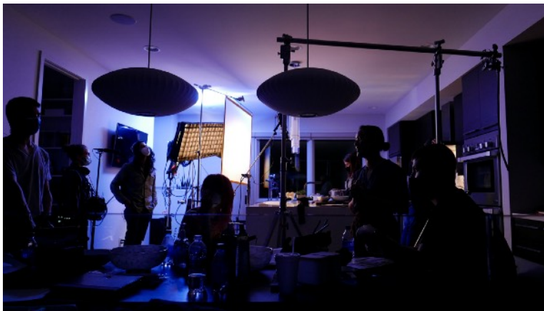
The “Lunchbox” crew preps the present-day kitchen.