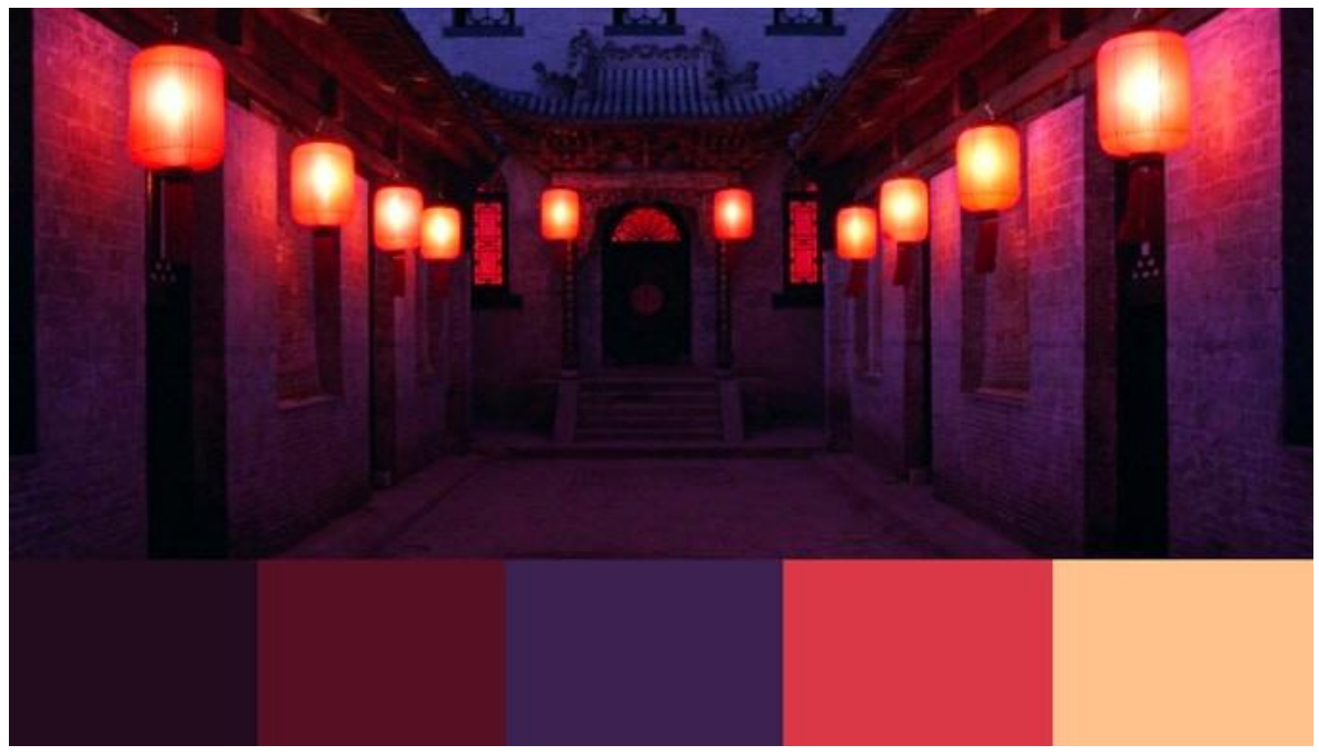
RAISE THE RED LANTERN (1991) Dir. Zhang Yimou