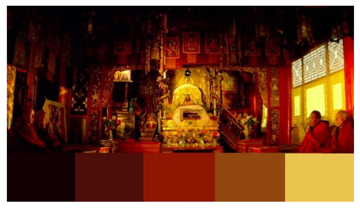
HORSE THIEF (1986) Dir. Zhuangzhuang Tian & Peicheng Pan