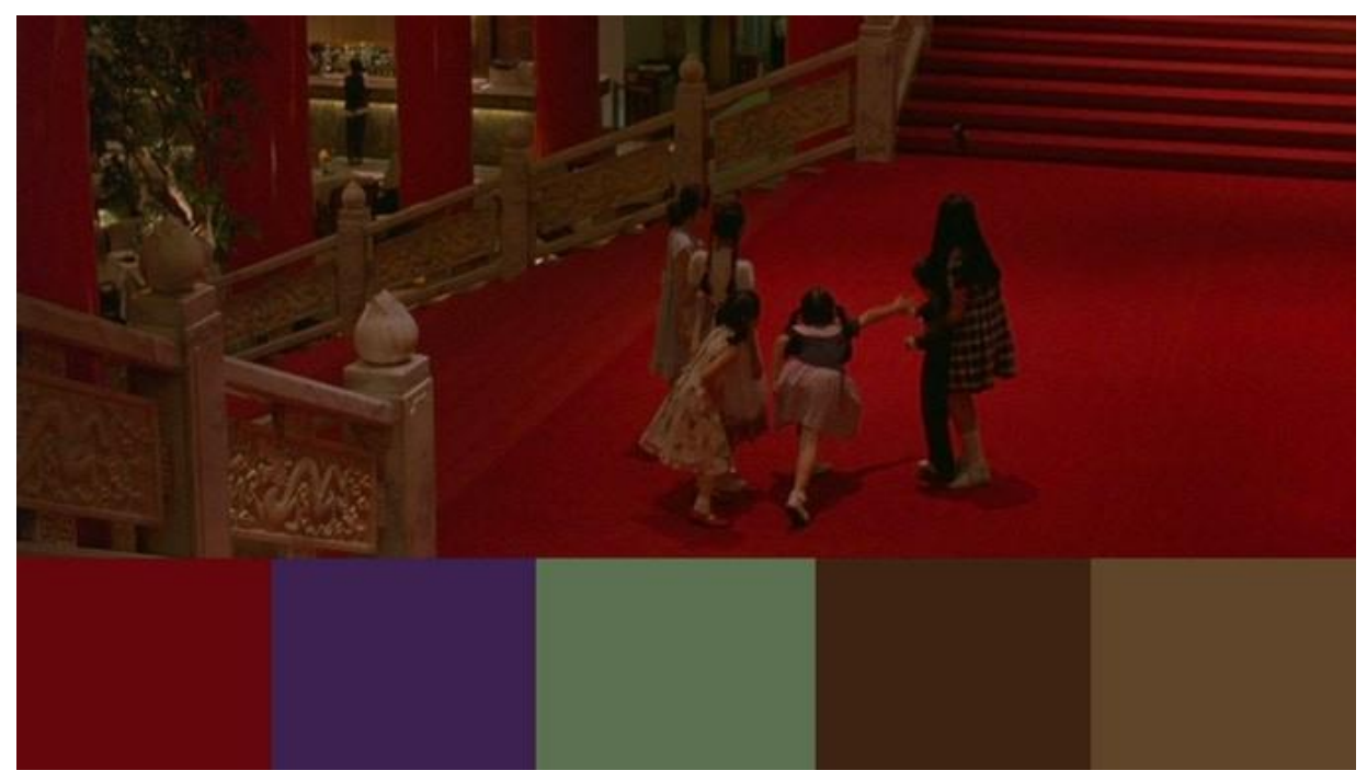
YI YI (2000) Dir. Edward Yang