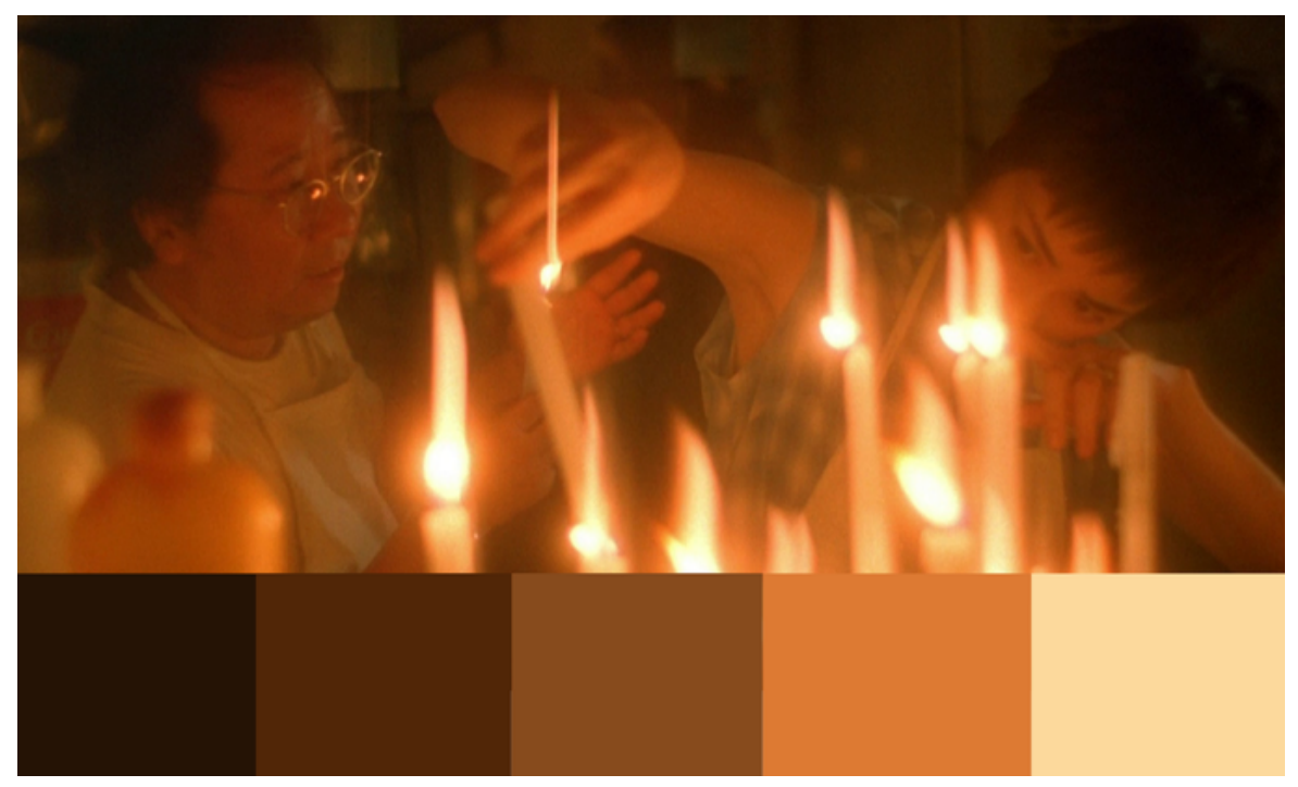
CHUNGKING EXPRESS (1994) Dir. Wong Kar Wai