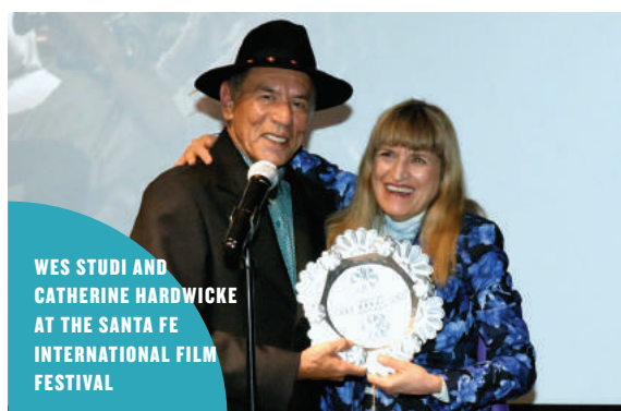
WES STUDI AND CATHERINE HARDWICKE AT THE SANTA FE INTERNATIONAL FILM FESTIVAL

Located in another of the best smaller cities on our list of the Best Places to Live and Work as a Moviemaker, this festival