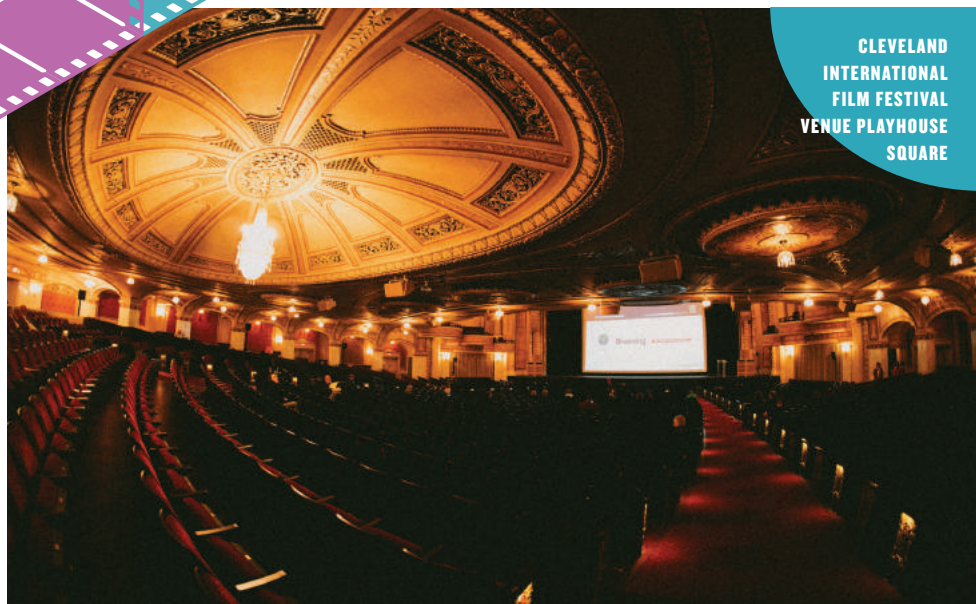
CLEVELAND INTERNATIONAL FILM FESTIVAL VENUE PLAYHOUSE SQUARE

as for giving back to the Cleveland community and offering one of the most generous prize packages of any festival. To make sure its screenings lead to tangible progress, it introduces creators to nonprofits that are devoted to the subjects of their films. It also offers programs and awards focused on BIPOC and LGBTQIA+ filmmakers. Its FilmSlam education program, meanwhile, integrates film studies into school curriculums, matching students in grades five through twelve with age-appropriate festival films. And about those prizes: In addition to generously helping invited filmmakers with airfare, lodging and local transportation, the festival last year handed out $131,500 to recipients of 34 awards. Filmmakers can also look forward to a packed schedule of parties, networking events and press opportunities, and distributors in attendance have been known to include Gravitas Ventures and Firelight Media. The latest edition will have just ended by the time you read this.