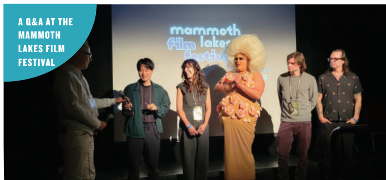
A Q&A AT THE MAMMOTH LAKES FILM FESTIVAL

Music City turns into Music and Movie City when the festival unrolls its blend of top-tier films and outstanding networking opportunities with top agencies, distributors and more. Last year's two-day creators conference included panels with topics including The Power of Latin Music In Media, Getting The Best Score For Your Film, and Virtual Content Creation. Past participants have represented the likes of HBO, Rolling Stone , Sony, Kino Lorber and Utopia, among others. Another highlight is the annual Music Supervisors Program, showcasing all the diverse musical stylings Nashville has to offer. You can also enjoy events at famed locales like the National Museum of African American Music, The Bluebird Café and Third Man Records. Additionally, United Talent Agency opened its doors last year for a pitch session for screenwriters seeking in-depth feedback from a panel of industry judges. The festival offers generous help with travel and accommodations, and last featured screenings including Nanny and The Return of Tanya Tucker: Featuring Brandi Carlile . The festival also hands out 25 awards, with cash prizes from $500 to $3,000, and the Narrative, Documentary and Animated Shorts category winners are eligible to submit their films for Academy Awards consideration.