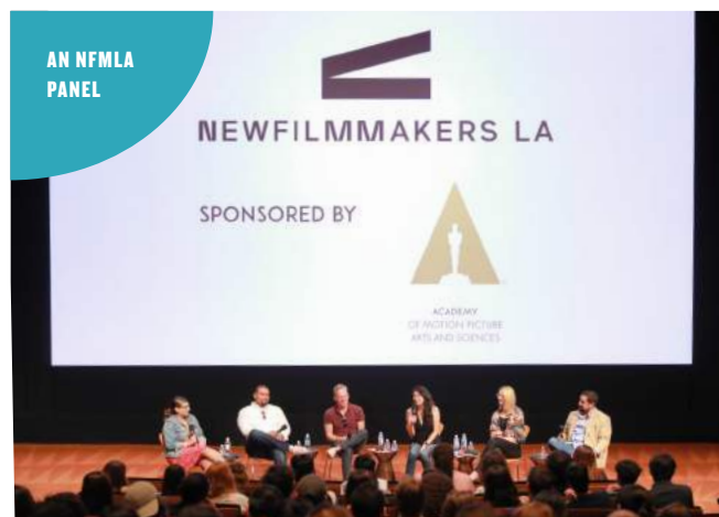
AN NFMLA PANEL