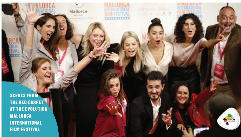
SCENES FROM THE RED CARPET AT THE EVOLUTION MALLORCA INTERNATIONAL FILM FESTIVAL