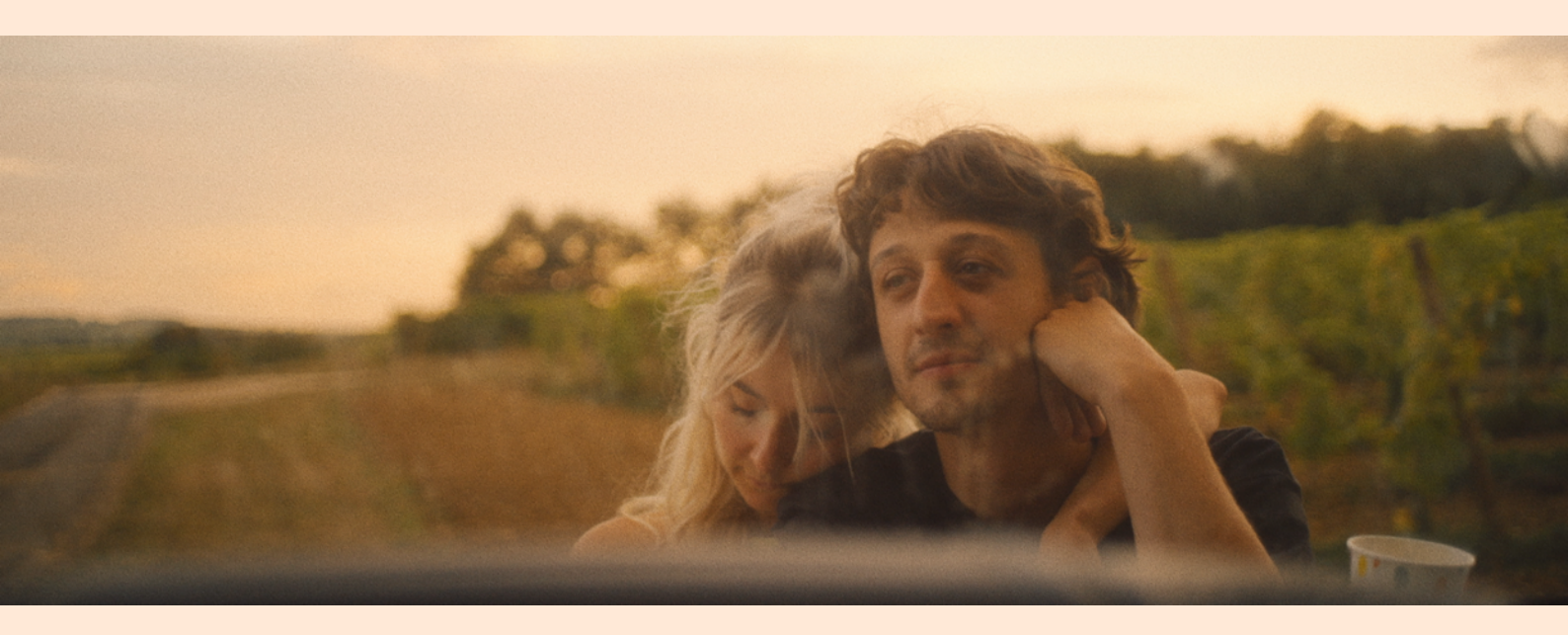
24'40" / The Netherlands / Cyrtocara Moorii Films / 2022