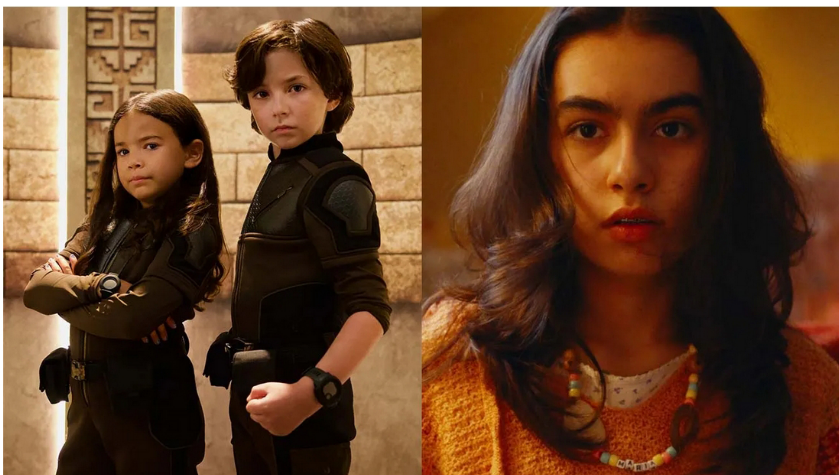
Spy Kids Armageddon and Fabula