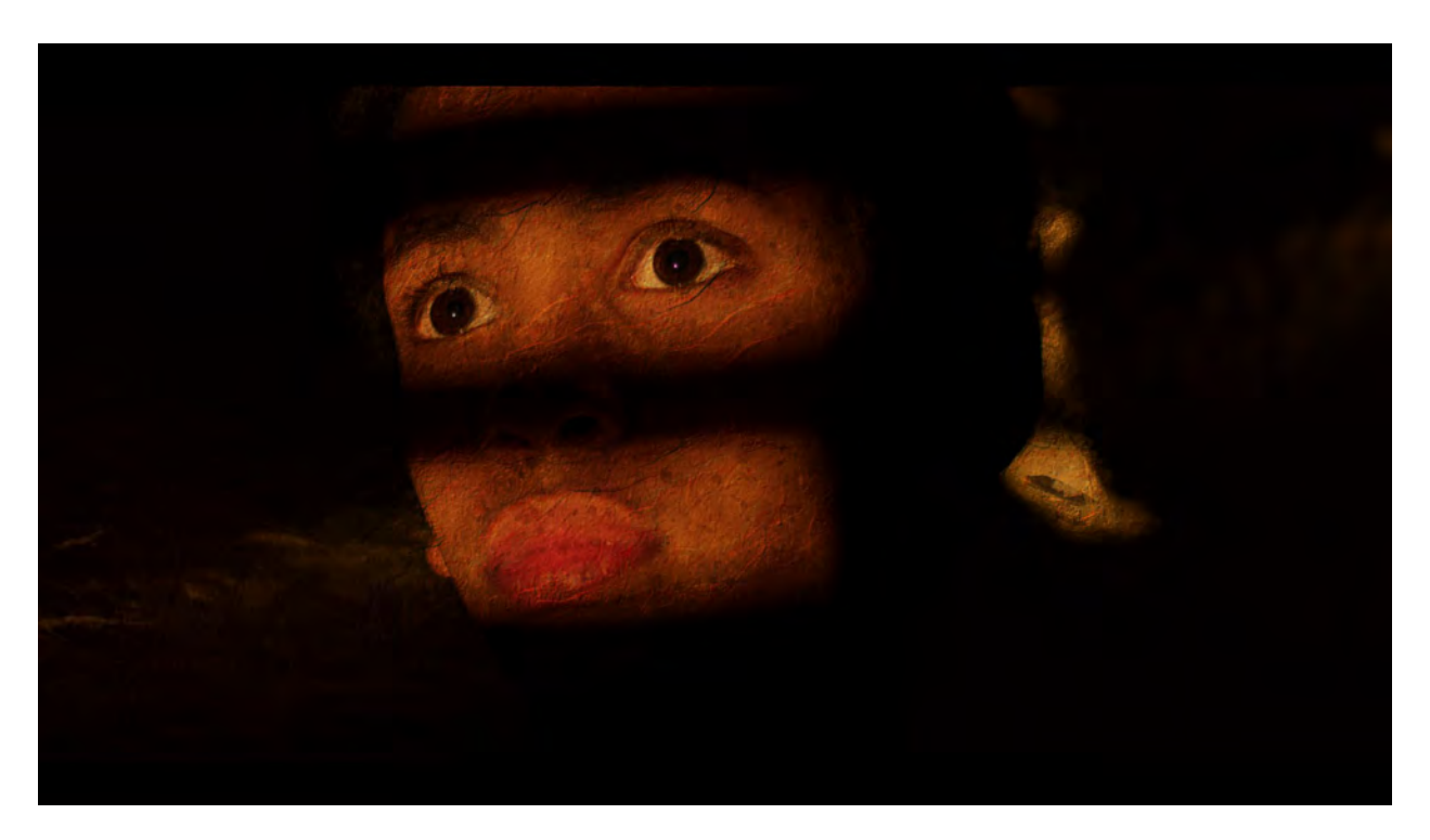
description (Hiding in Closet)