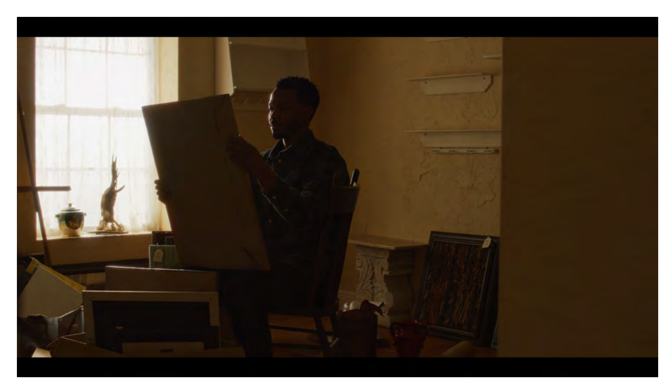
description (Surrounded by Art)