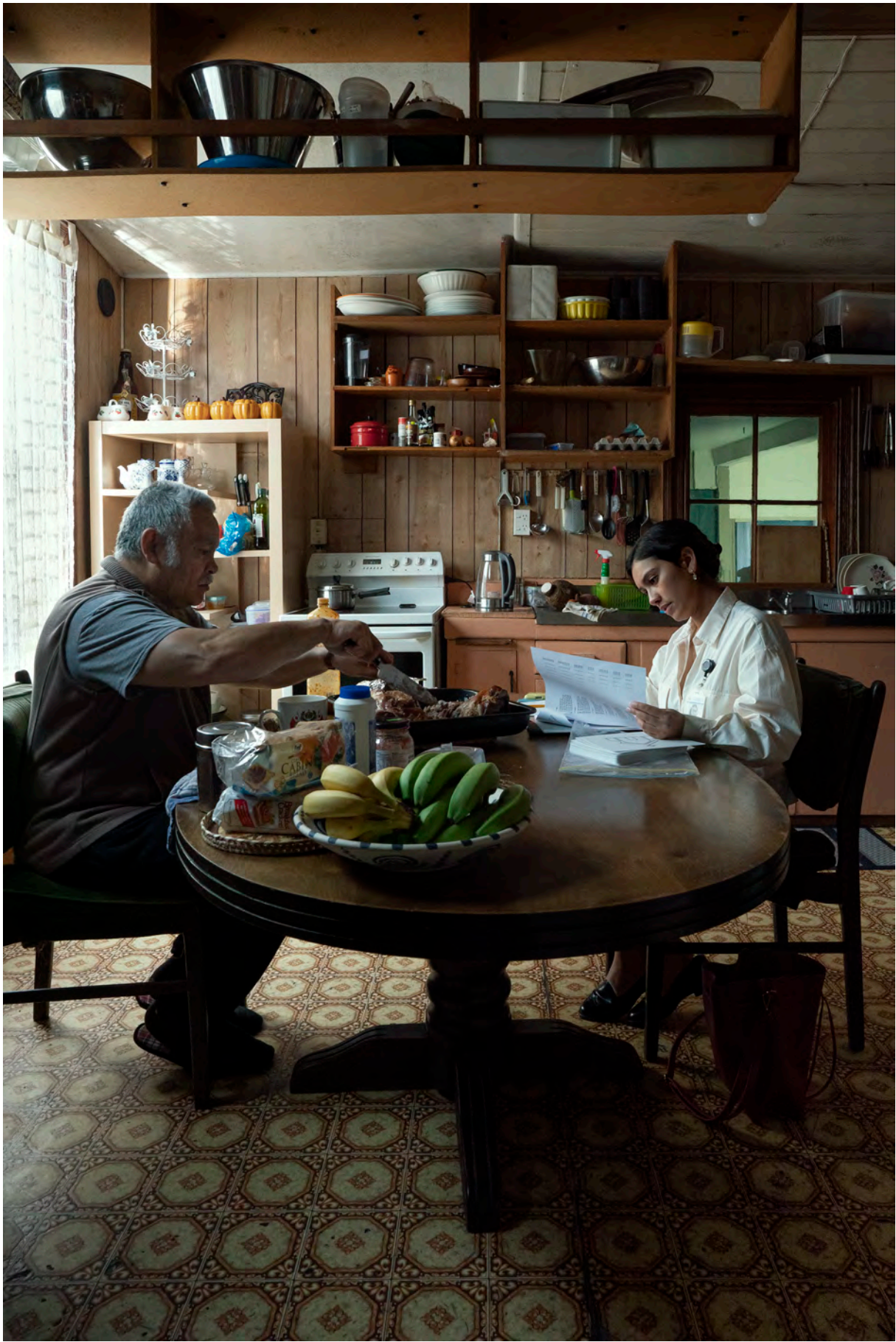
LEA TUPU'ANGA / MOTHER TONGUE. COPYRIGHT © 2024 RUN CHARLIE FILMS LTD. ALL RIGHTS RESERVED