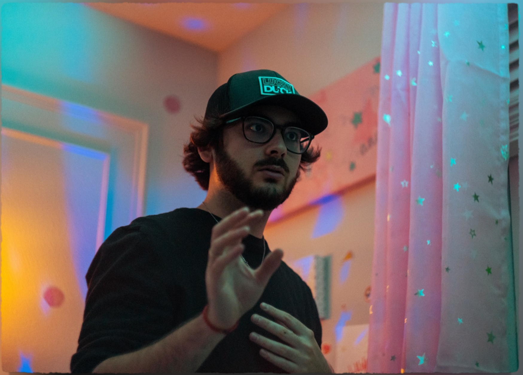
Luca Bueno directing "Luna" - 2022

Some of his credits as a director and writer include "Three" (2020), "The Dreamseller" (2016) and "Luna" (2022).