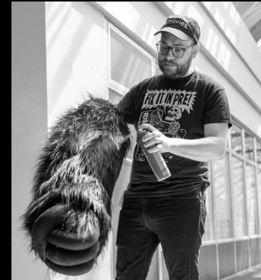
CREATURE FX DESIGN / EDITOR MARC RIPPER FORTRIPPER.COM