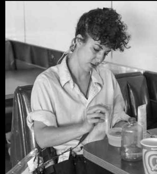
CREATURE FX DESIGN JULIA CALABRESE JULIACALABRESE.NET