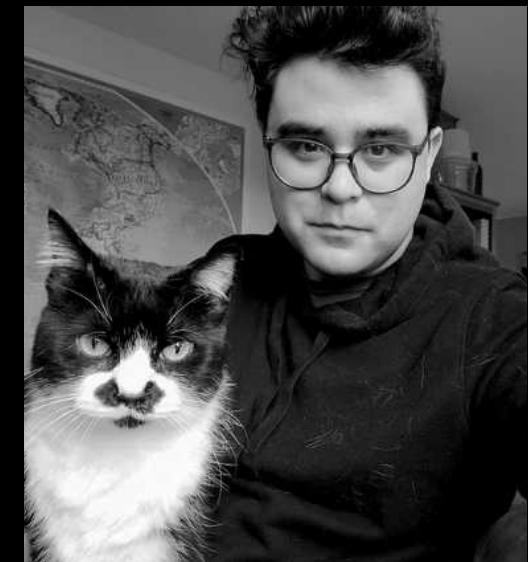
SOUND DESIGNER/MIXER JORDAN EUSEBIO JORDANEUSEBIO.COM