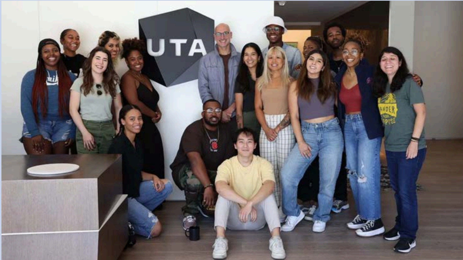
THE HOLLYWOOD REPORTER | ISSA RAE'S COLORCREATIVE REVEALS INAUGURAL FIND YOUR PEOPLE PROGRAM COHORT (EXCLUSIVE)