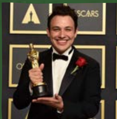
BEN PROUDFOOT HE/HIM