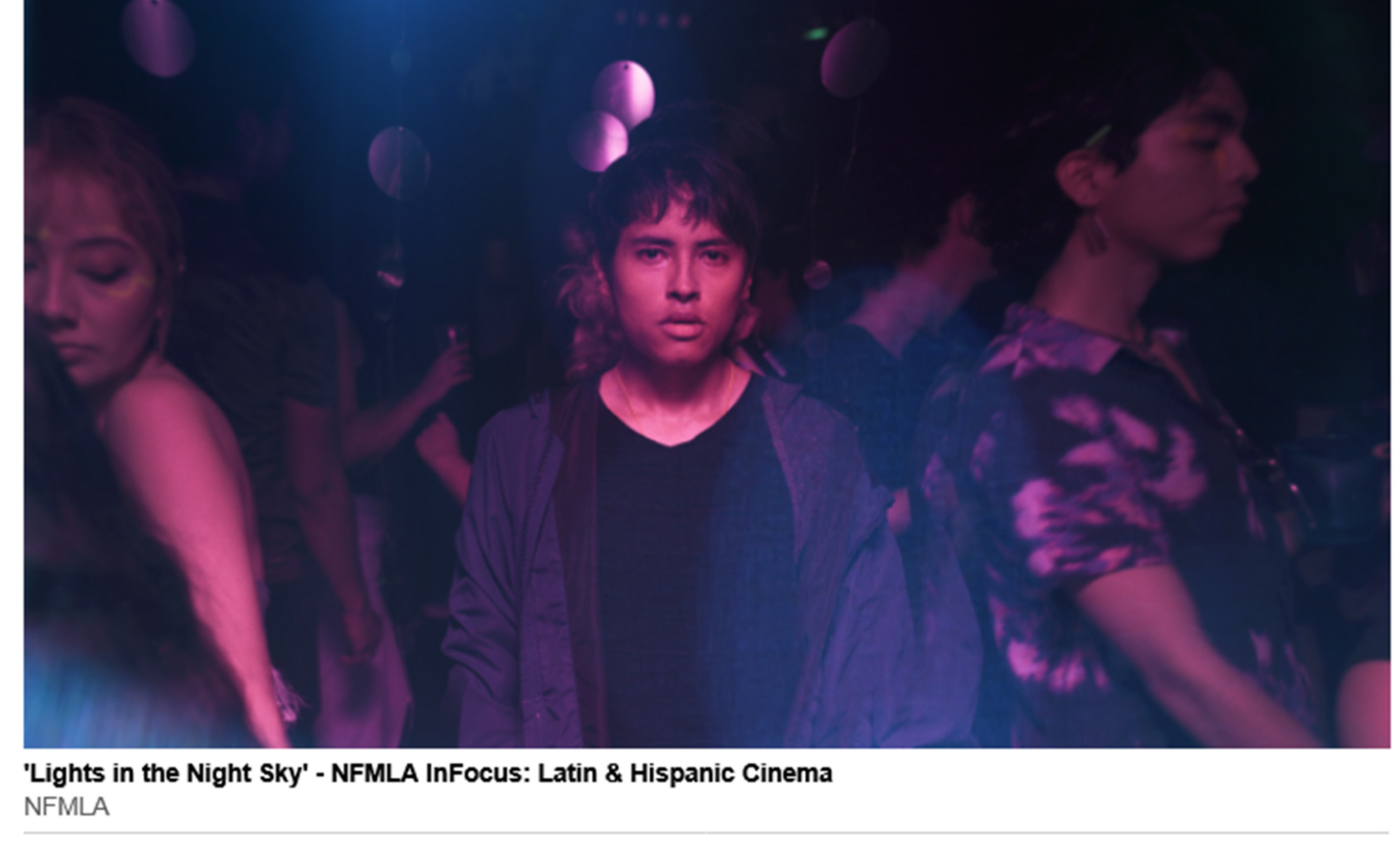
'Lights in the Night Sky' - NFMLA InFocus: Latin & Hispanic Cinema