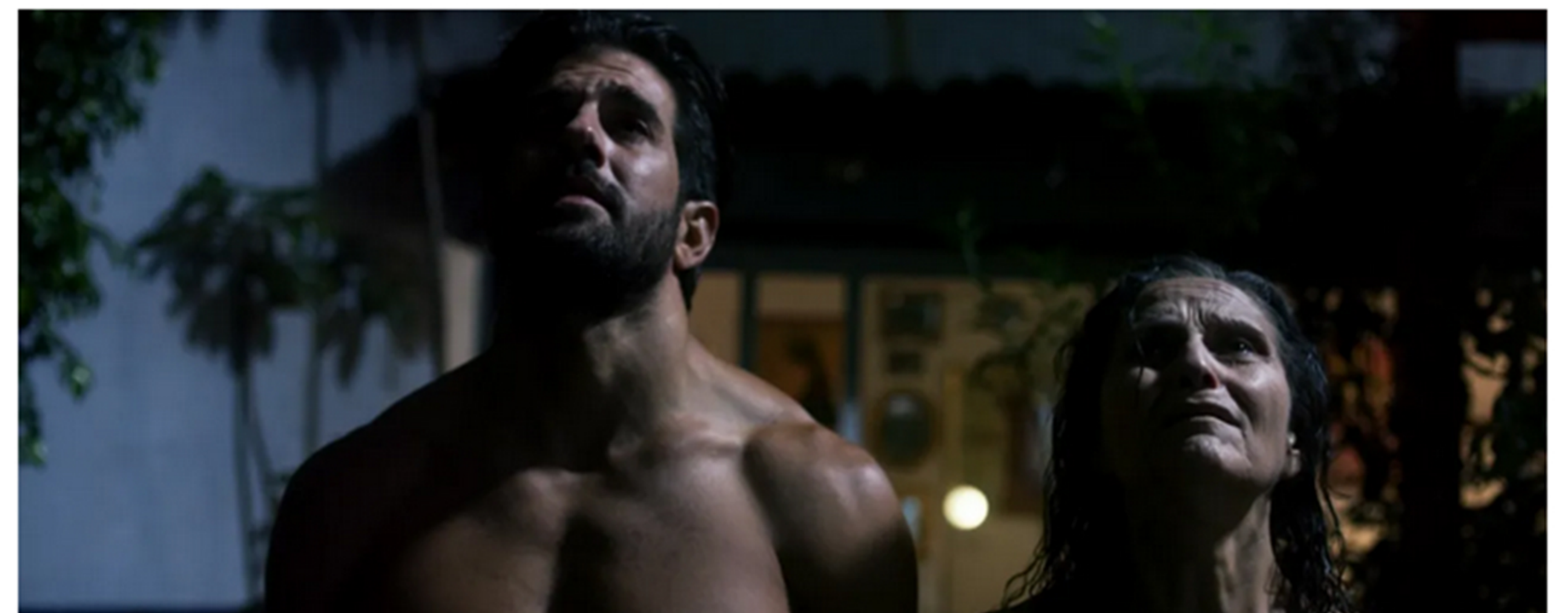
'Sueño' – NFMLA 'InFocus: Latin & Hispanic Cinema'