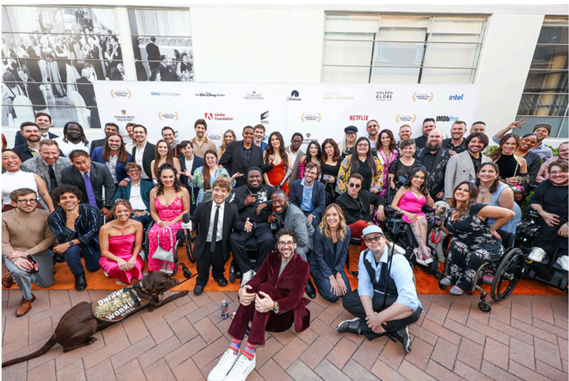
Finalists of the 11th Easterseals Disability Film Challenge Awards at Sony Pictures on May 9, 2024.

The Golden Globe Foundation was created in 2023 following the sale of the Golden Globes to Dick Clark Productions, which shares a parent company, PMC, with The Hollywood Reporter , and Eldridge, a holding company owned by Todd Boehly. The proceeds of that sale and existing resources allow the organization to continue a longstanding mission of philanthropy. Over the last three decades, officials have doled out $60 million.