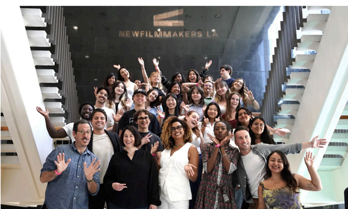
A group shot featuring NewFilmmakers L.A.