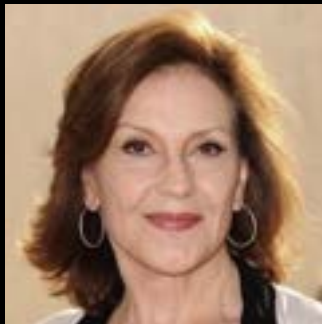
Kelly Bishop (Glenna, the leading lady)

Kelly Bishop started her career as a dancer. After appearing in the Broadway shows Golden Rainbow: Promises, Promises and On The Town , Bishop originated the role of Sheila Bryant in the groundbreaking musical A Chorus Line . The role was largely based on Bishop's own life, and would earn her the 1976 Tony Award for Best Featured Actress in a Musical.