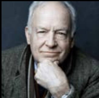
Reed Birney (Jerry, the standby)

Reed Birney won the 2016 Tony Award for his performance in The Humans . Other Broadway appearances include: 1984 , Gemini , Picnic and Casa Valentina (Tony nomination, Drama Desk Award).