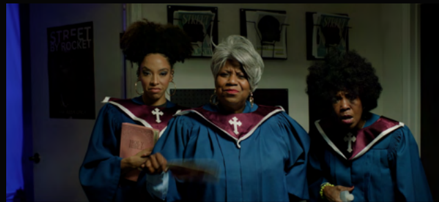
Production stills — Pink Ozs